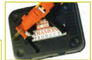
Convenient WEKA carrying case