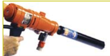
WEKA DK12 handheld drill